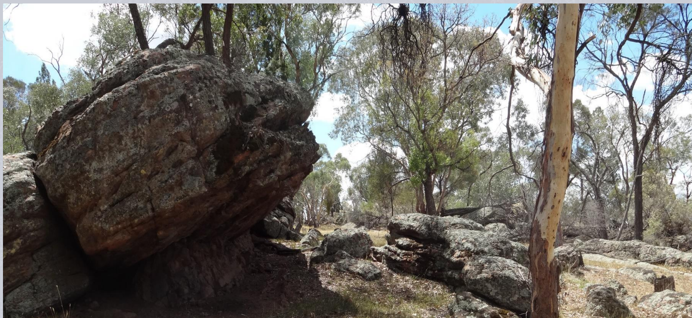
Some of the beautiful rocky bushland to be enjoyed at the EASTER 2020 Australian 3 Days ~ April 10-13 Orange / Molong

For more Easter 2020 information see Eventor or visit the website .