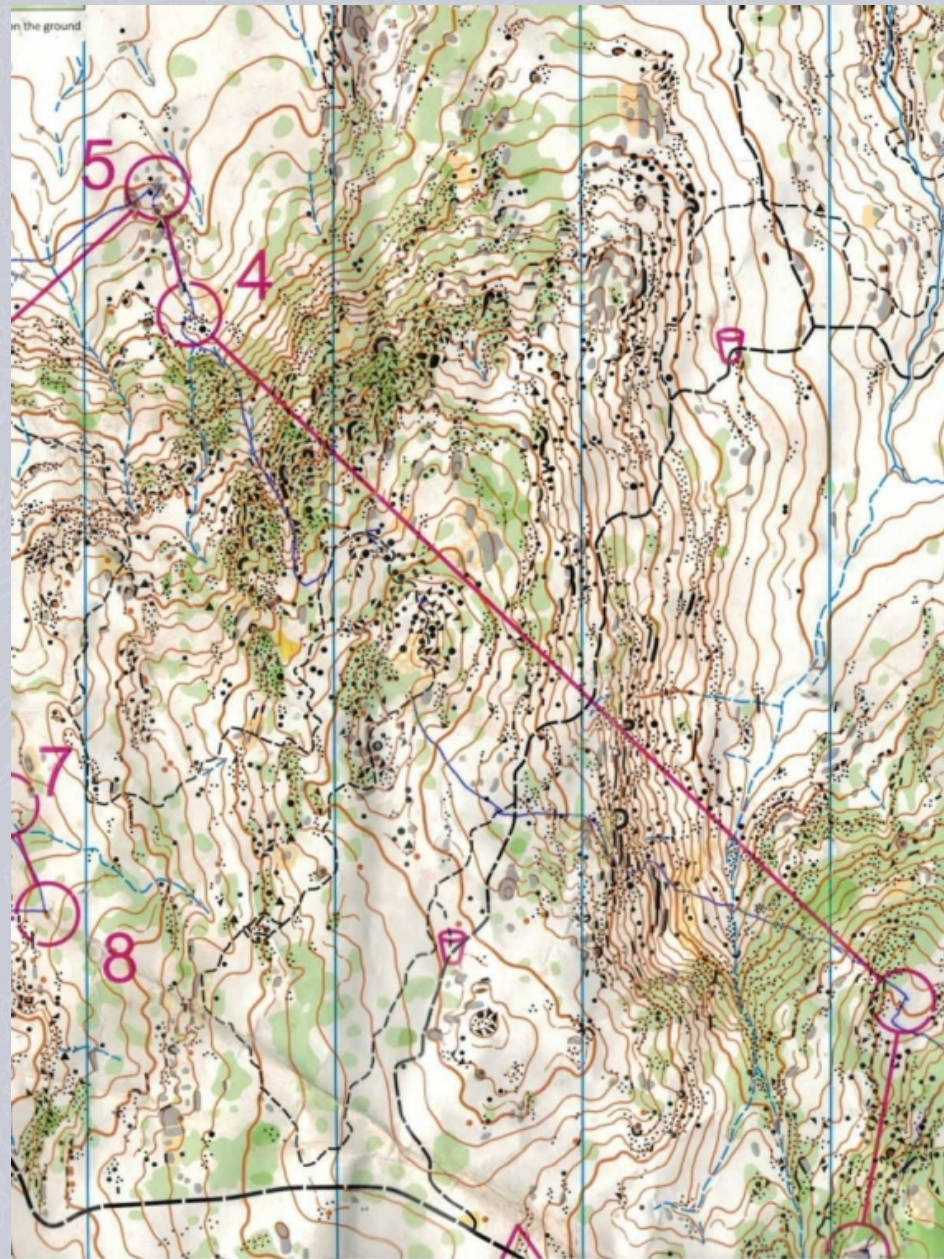
Challenging Stuff! Terry's 3-4 leg (& blue line route) at Oceania Long Champs