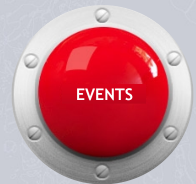
Big Red Button