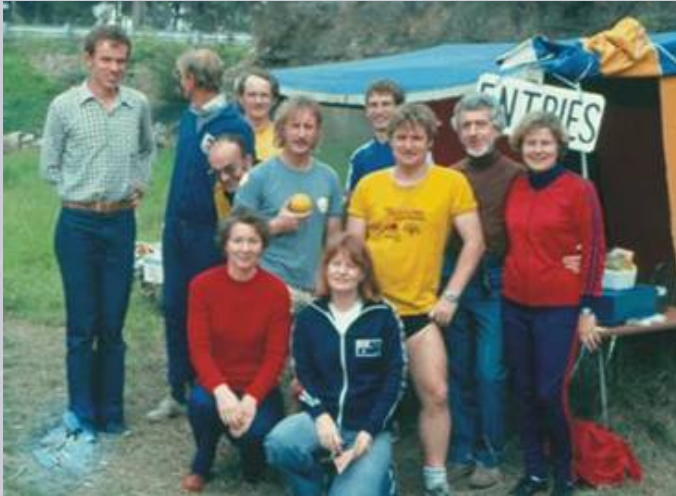
Bennelong Registration 'Tent' - Lake Parramatta 1979